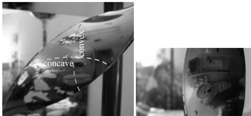
(replace with photo)