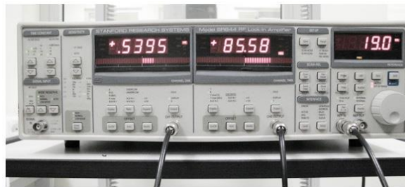
Figure 1: Lock-In Amplifier front view ( http://www.nano.org.tr/lock-in_amplifier.html )

A Lock-In Amplifier, otherwise known as a phase-sensitive detector, is an electronic instrument designed to extract wanted signals that are usually accompanied by unwanted noise, disturbances, or background interference. This instrument reduces the unwanted interference in order to increase the clarity of the desired signal to enhance the overall signal-to-noise ratio of the electric signal being measured. This means that if the signal of interest oscillates at a known frequency, the Lock-In Amp can amplify only at that frequency and average out any random noise. Recovering signals at low signal-to-noise ratios requires a strong, clean reference signal the same frequency as the received signal. This is not the case in many experiments, so the instrument can recover signals buried in the noise only in a limited set of circumstances. An image of a Lock-in Amp is shown below.